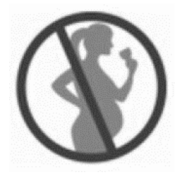
Figure 1: Standard pictogram

The standard pictogram refers to the pictogram with a silhouette of a pregnant woman holding a drinking glass enclosed within a circle with a diagonal strikethrough (Figure 1). The standard pictogram may come in various colour combinations (e.g. black with red strikethrough, monochrome, greyscale). The standard pictogram is used as part of DrinkWise Australia and Cheers voluntary warning label initiatives.